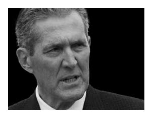
An independent arbitrator has sided with Unifor in a key battle against the Manitoba government over layoffs proposed in 2020.