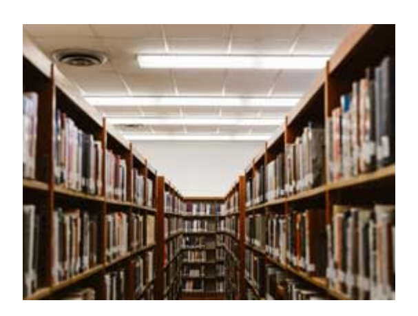
The Unifor 2022 scholarship application period is open. Review the requirements and submit your application now.