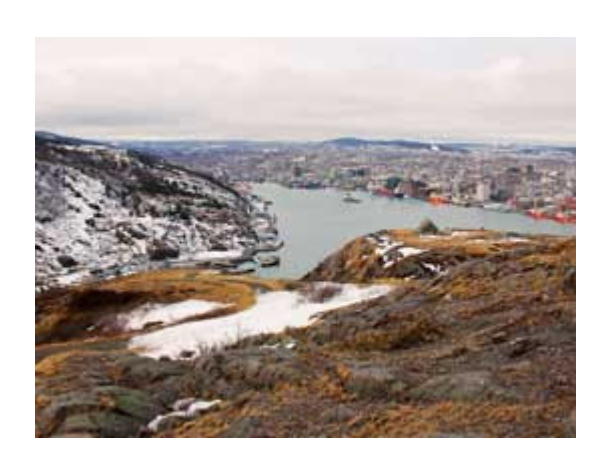
For the first time in three years, Atlantic Regional Council will meet in person! We look forward to seeing you in beautiful St. John's, Newfoundland and Labrador. Register delegates from your local today.